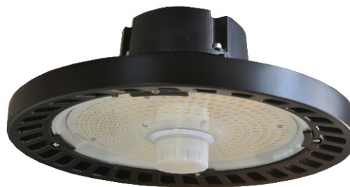
Integrated Occupancy Sensor version